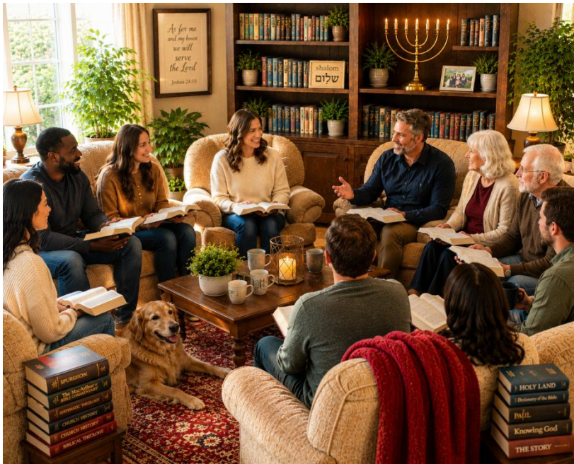
Home Fellowship & Bible Study

one another, and are encouraged in the ways of the LORD.